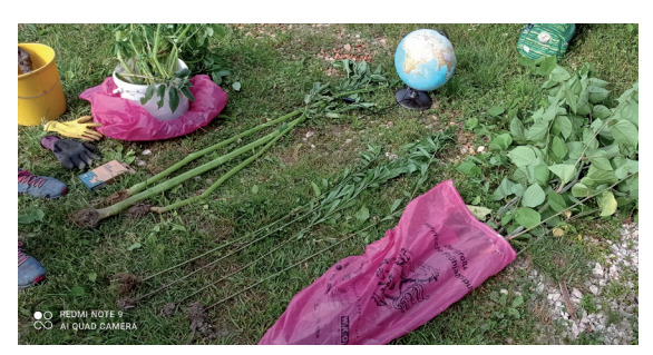
Figure 8 — Neophyte management with pupils at the primary school in Aigen.

tenmarkt primary school participants wondered what superpowers the neophytes might have – What can the giant hogweed do? – and designed posters, which were presented to the other students.