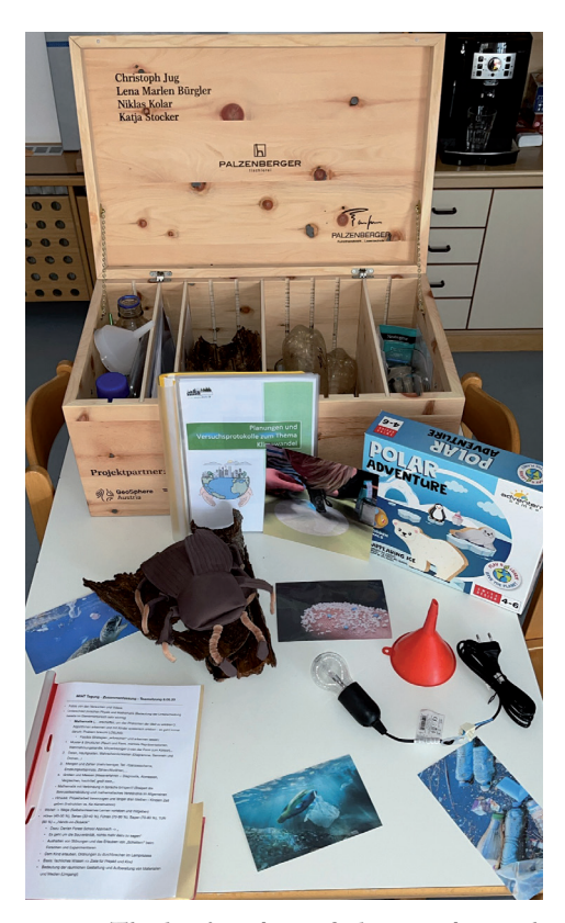
Figure 5 – The kit for relating findings to climate change.

An important aspect of the project was the involvement of students at the Bundes Bildungsanstalt für