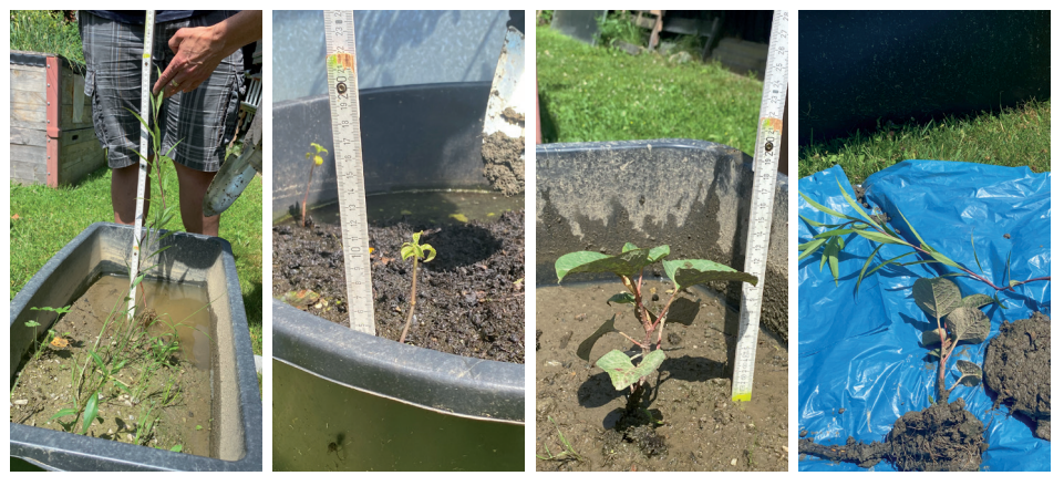
Figure 6 – From left to right: Goldenrod, Himalayan balsam, Japanese knotweed and roots/rhizome and stems of goldenrod & Japanese knotweed on 21 June 2023; Japanese knotweed and goldenrod, showing roots and leaves

The BAfEP students wrote their final-year dissertations in parallel to the development of the kits, as the