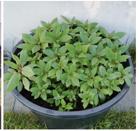
Figure 7 – Planting invasive neophytes, and monitoring their growth. Left: Japanese knotweed; right: Himalayan balsam.

young children tried out the experiments and games in school: "Discovering climate change with children aged 3–6 with the help of planning, observations and experiments in the Styrian Eisenwurzen region" (Jug et al. 2023), and "What's blooming? Research using plant newcomers from all over the world with children aged 3–6" (Gindel et al. 2023).