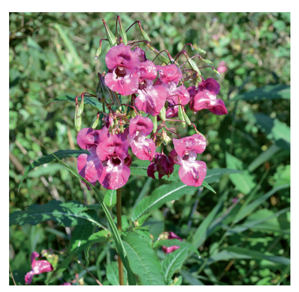
Figure 1 — Flowering Himalayan balsam (Impatiens glandulifera).

The plant species investigated were the Canadian and giant goldenrod (Solidago canadensis, Solidago gigantea), ragweed (Ambrosia artemisiifolia), Himalayan balsam (Impatiens glandulifera), giant hogweed (Heracleum mantegazzianum), robinia / black locust (Robinia pseudacaciae), and Japanese knotweed (Fallopia japonica) (Figure 1). For the purposes of this project, the two species of goldenrod were considered together. They were selected because most of them are already widespread in Styria (and Austria more widely), and they are easily recognizable for the general public. Four of these species were introduced as ornamentals; robinia / black locust is of forestry importance, while ragweed was introduced accidentally. Ragweed pollen causes res-