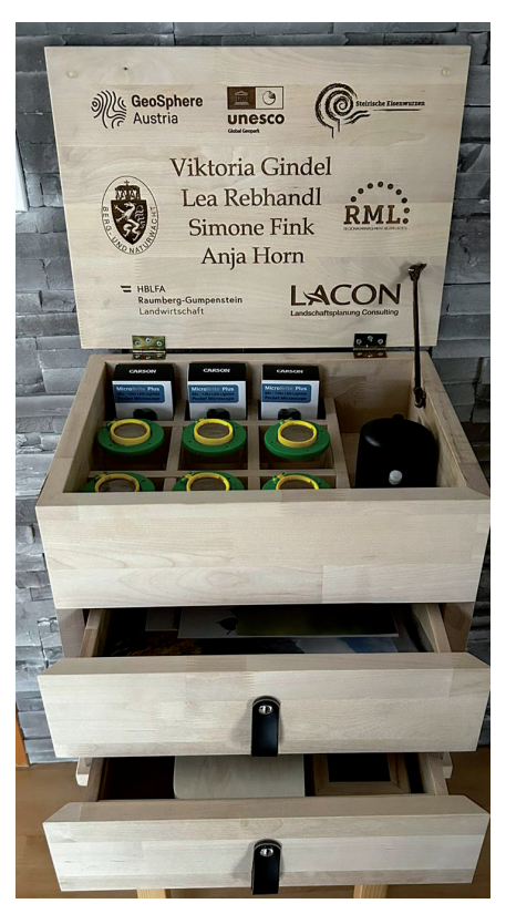
Figure 4 — The kit for investigating invasive neophytes.

monitoring. Within our project, we developed a new function specifically for observing invasive neophytes (Figure 3). All data gathered from the observation sheets and the Nature Calendar app were forwarded to GeoSphere Austria and are currently being stored in a database for future analysis as the data density and observation period increase. The information gathered will be of interest to a range of stakeholders, from climate scientists to biologists and medical professionals.