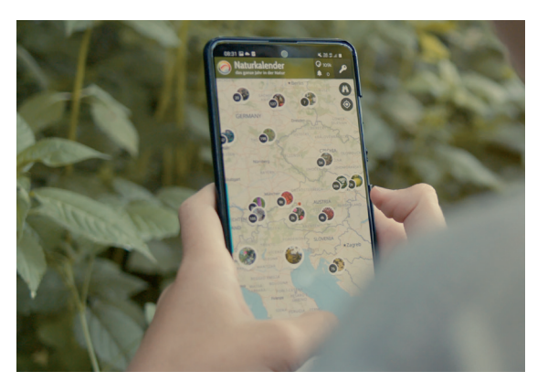
Figure 3 — Nature Calendar app for observation of invasive neophytes and native plants.

The project partners developed lesson plans and teaching folders for the individual school levels.